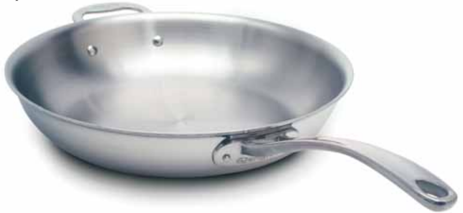
POT-330F • 30 cm / 11.8 in. diameter

This deep skillet offers practicality and performance with its spacious interior.